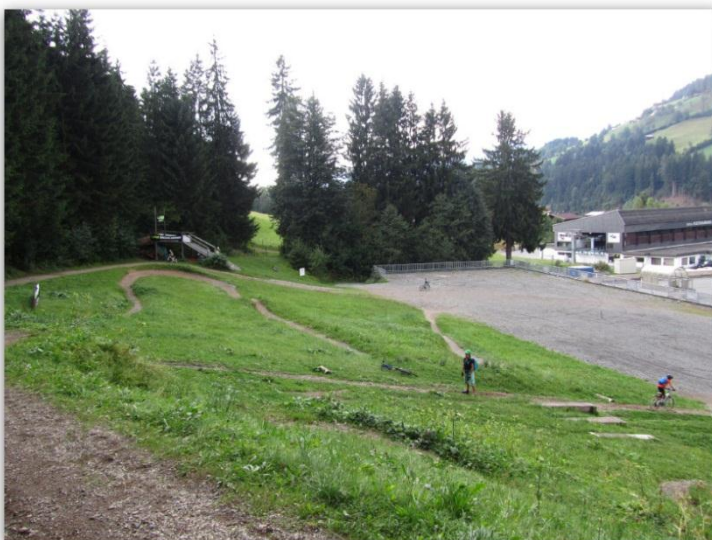
Location, start and finish area