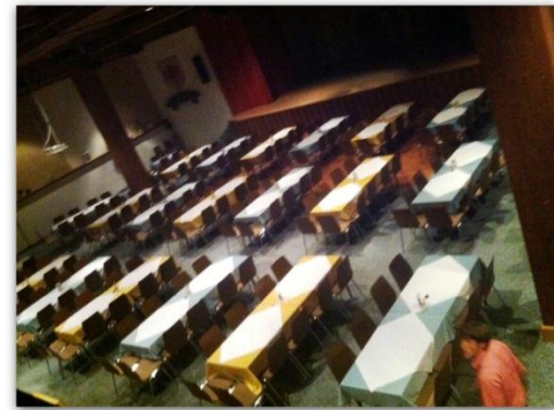
Culture program for max. 700 people

Inspections of the start and finish were made; track profile, technical matters as well as requirements and needs of both sides were explained and made for clarification.