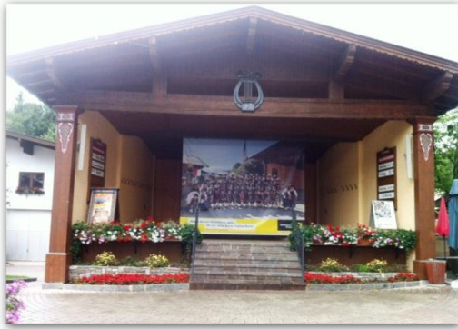
Open and Medal ceremony