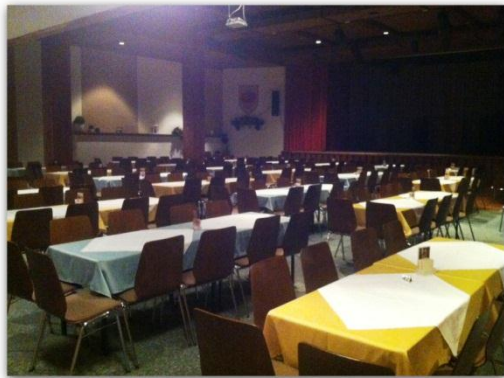
Closing ceremony, Banquet